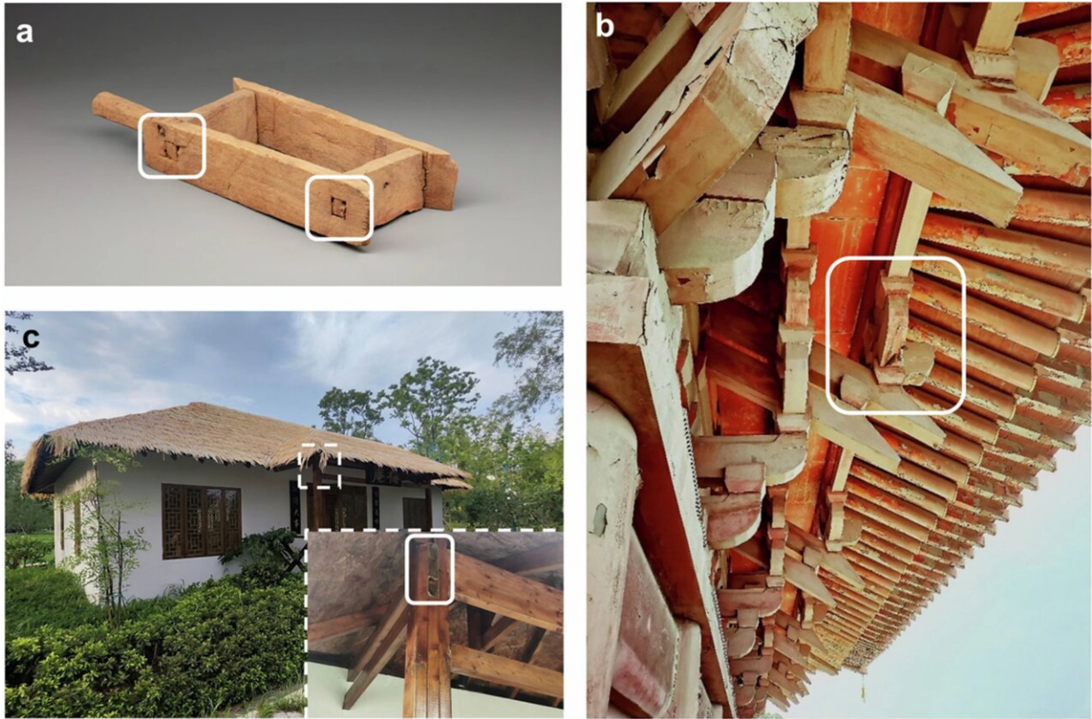
Photos of traditional wood-based construction and carpentry.

The new interfaces introduced by this research team were inspired by various joints commonly used by carpenters, including mortise-and-tenon and finger joints. These joints were found to enhance contact between materials, converting compressive stress into shear stress.