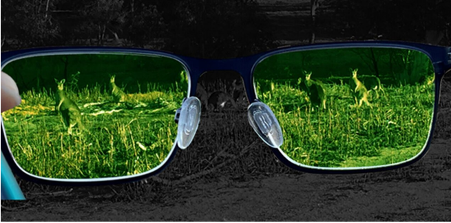
Artist's impression of the view through future night-vision glasses. Credit: Lei Xu / NTU, Author provided

It's a familiar vision to anyone who has watched a lot of action movies or played Call of Duty : a ghostly green image that makes invisible objects visible. Since the development of the first night-vision devices in the mid-1960s, the technology has captured the popular imagination.